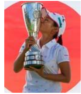
Ai Miyazato (JPN) Evian Masters