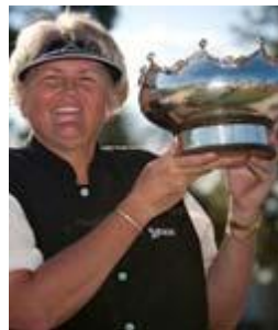
Laura Davies (ENG) Women's Australian Open