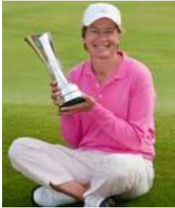
Catriona Matthew (SCO) Ricoh Women's British Open